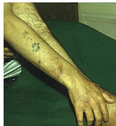
Figure 4. Photoallergic contact dermatitis on the dorsal forearm in a patient treated locally with preparation containing chloramphenicol and coagulase for a venous ulcer.

We (S.G.V. and G.M.) recently observed a case of photoallergic contact dermatitis in a patient treated for a venous leg ulcer with a preparation containing chloramphenicol and coagulase ( Figure 4 ).