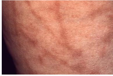
Figure 1. Phytophotodermatitis caused by contact with parsley plant.

pounds reported in the literature, several mechanisms play varying roles. Two principal types of reactions are generally accepted, regardless of the route of administration of the photosensitizer: phototoxicity and photoallergy. In a third category of reaction, photosensitizing drugs may induce or exacerbate disorders such as lupus erythematosus in which photosensitivity plays a prominent role.