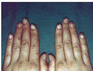
Figure 5. Tetracycline-induced chromonychia: brown-gray discoloration of the distal portion of several nail plates.

Tetracycline antibiotics serve as an excellent example of the phototoxic hazards of antibacterial agents. Among them, chlorderivatives are most frequently reported to cause phototoxicity. 9,49,50 Chlortetracycline and doxycycline are more photoactive than tetracycline, oxytetracycline, methacycline, or minocycline. In one study, 51 doxy-