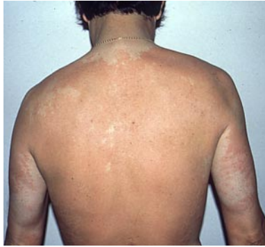
Figure 2. Doxycycline-induced phototoxic eruption resembling sunburn.

Phototoxic reactions result from direct cellular damage produced by the photoproducts, provided enough of the chemical and radiation are present. No immunologic mechanisms are involved in phototoxic reactions, so they can manifest themselves during an initial exposure. Phytophotodermatitis caused by bergamot oil, parsley, celery, dates, and other plants containing the furocoumarins is a classic example of phototoxic reaction ( Figure 1 ). At a molecular level, most phototoxic reactions (eg, in the case of acriflavine, porphyrins, chlorothiazide, tetracyclines, nonsteroidal anti-inflammatory agents, quinolones, and certain dyes, such as methylene blue) develop in the presence of oxygen, in which free radicals resulting from photo-oxidation and peroxidation processes cause injury to cell nuclei, cytoplasm, and cellular membrane components. Phototoxicity reactions to psoralens, although rarely requiring molecular oxygen, are for the most part oxygen independent. In those cases, UV-A-induced covalent binding (formation of cyclobutane dimers) between the chemical and the molecules of DNA occurs. Similar dimers are