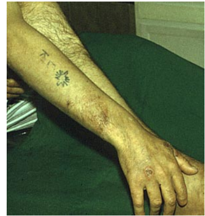
Figure 4. Photoallergic contact dermatitis on the dorsal forearm in a patient treated locally with preparation containing chloramphenicol and coagulase for a venous ulcer.

We (S.G.V. and G.M.) recently observed a case of photoallergic contact dermatitis in a patient treated for a venous leg ulcer with a preparation containing chloramphenicol and coagulase ( Figure 4 ).