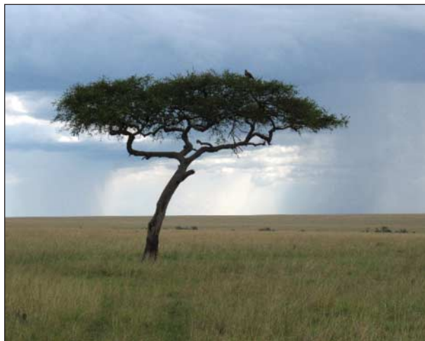
Acacia tree, Maasai Mara National Reserve, Kenya, Africa.